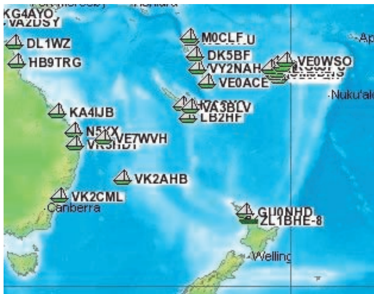
Fig. 2 Robust-Packet tracking-mode

packets are additionally protected by CRC. To ensure synchronization each packet is lead in with a 160 ms preamble of 64 DPSK symbols distributed across all eight carriers. The decoder output is divided into data and signaling information (call signs with SSID (Secondary Station ID), package identifier (PID) and AX.25 control word). Data may be displayed as US ITA5 or HEX. The PID specifies the Layer 3 protocol used.